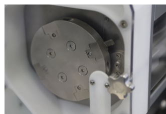
Detail of rotary cutter

Before a strand enters the cutting section of the instrument, the belt length ensures sufficient cool down of the strand, so cutting can be executed with maximum precision. To meet a broad range of polymer formulation and throughput needs, the instrument is available with