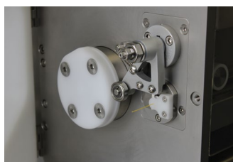
Detail of linear cutter