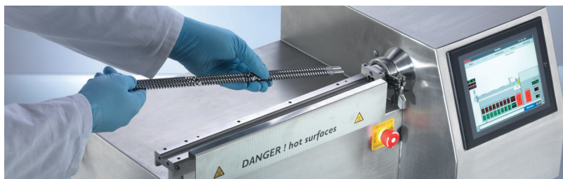
Easy cleaning due to clam shell barrel design with removable top half barrel.

Hot melt extrusion is gaining importance in the pharmaceutical industry. Our 11 mm compounder is also addressing the specific needs in the pharmaceutical industry and is available as a pharma version, too – manufactured according to GMP standards.