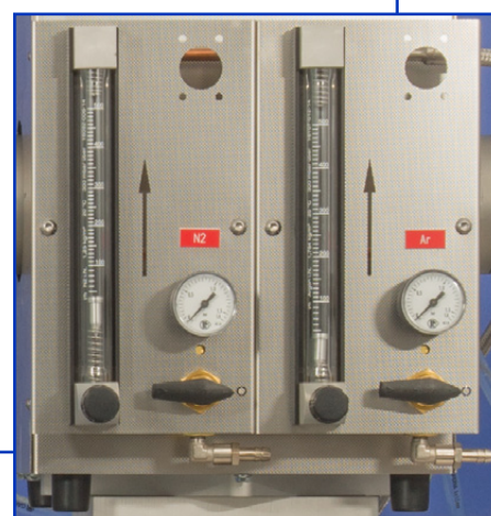
gas supply system