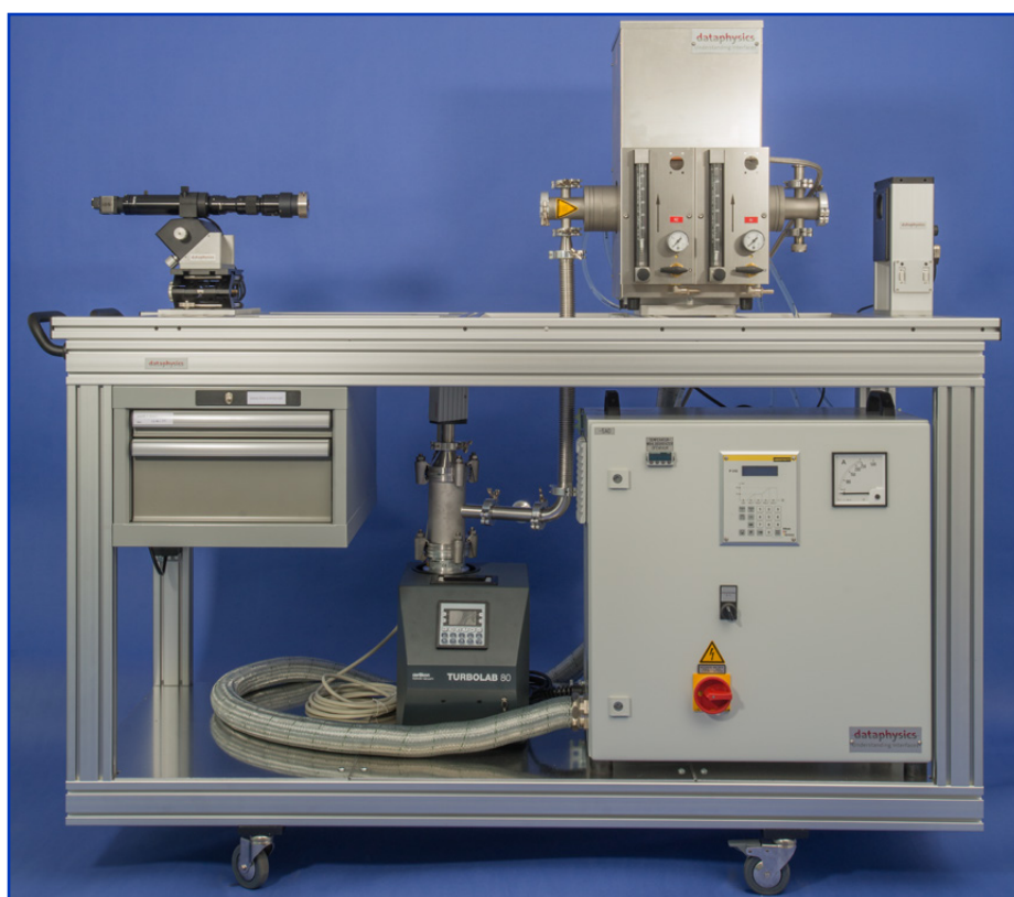
OCA 25-HTV 1800 with optional trolley cart

Video-based contact angle measuring and contour analysis system for high temperatures and vacuum