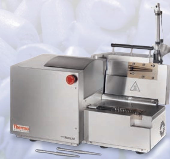
HAAKE MiniLab II Micro-Compounder