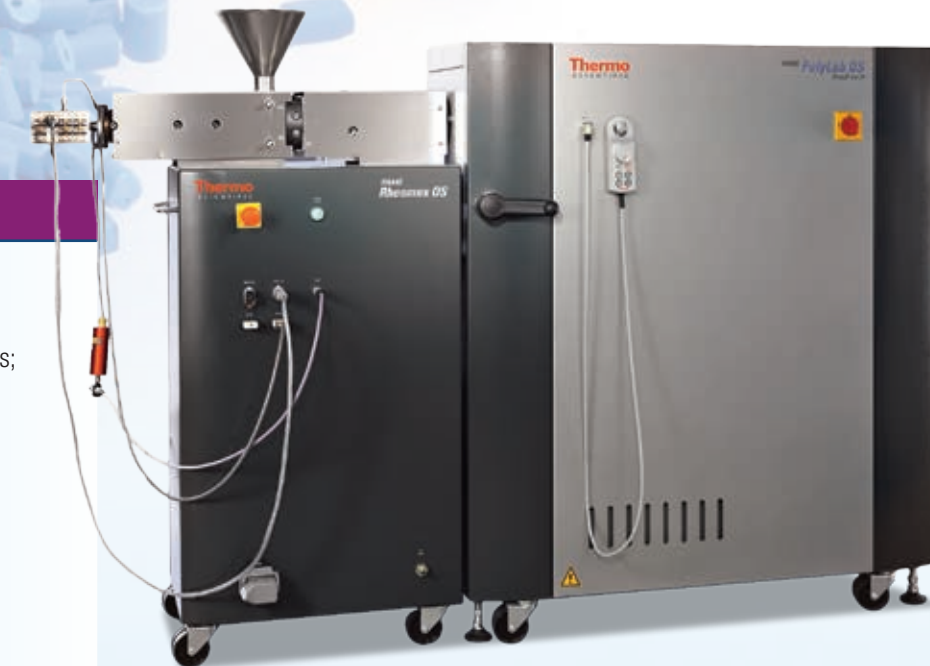
HAAKE Rheomex CTW 100 Extruder (left) connected to the PolyLab OS Drive Unit (right)