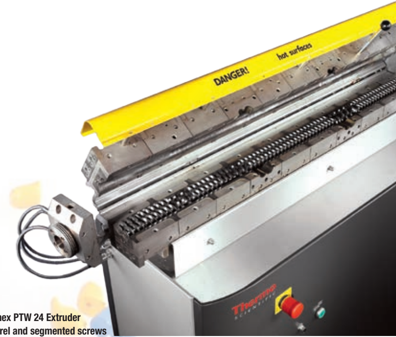
HAAKE Rheomex PTW 24 Extruder with open barrel and segmented screws