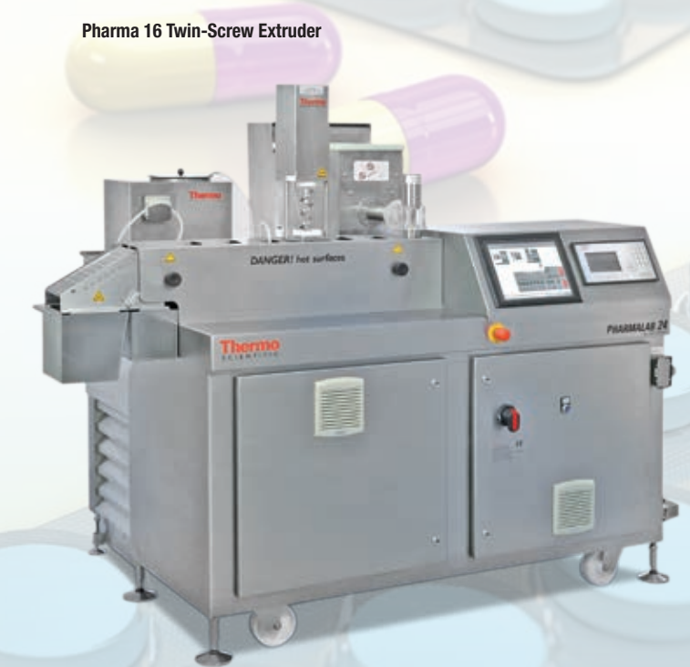
Pharma 24 Twin-Screw Extruder