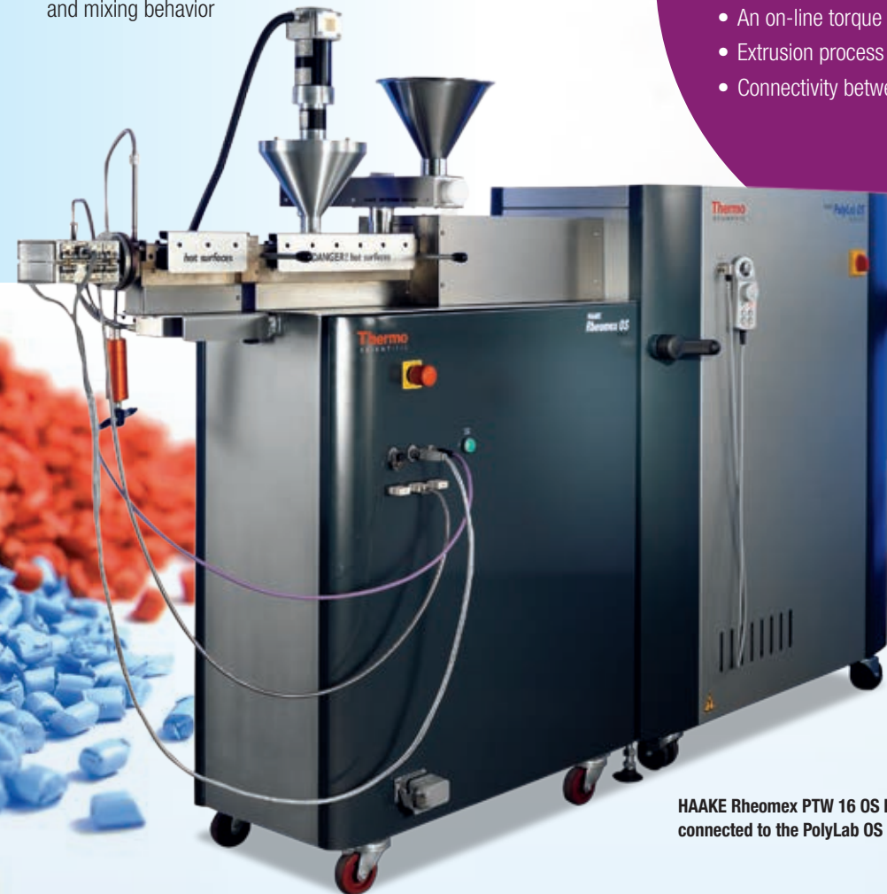
HAAKE Rheomex PTW 16 OS Extruder (left) connected to the PolyLab OS Drive Unit (right)