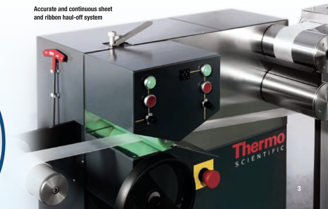
Accurate and continuous sheet and ribbon haul-off system