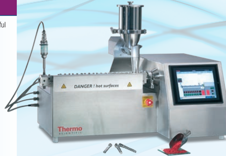
Process 11 Extruder