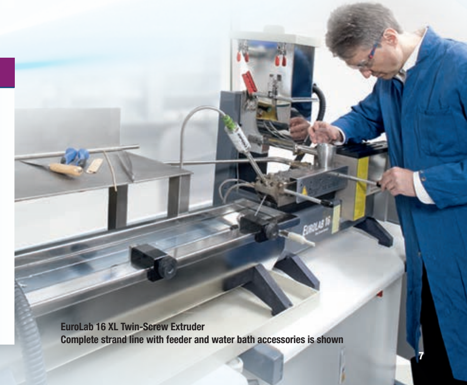
EuroLab 16 XL Twin-Screw Extruder Complete strand line with feeder and water bath accessories is shown