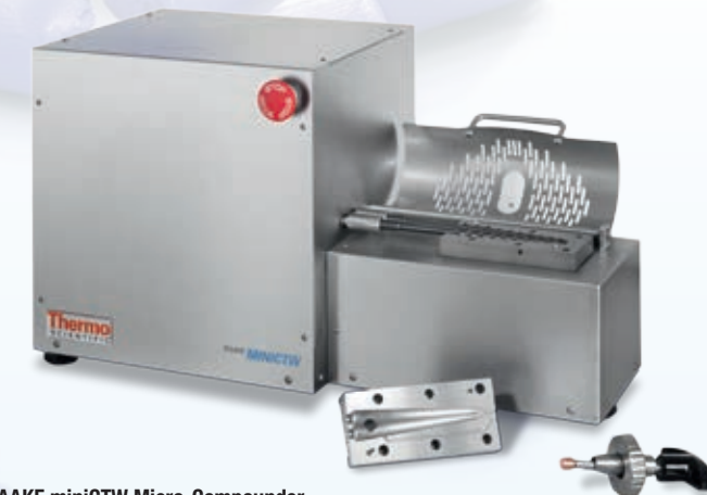
HAAKE miniCTW Micro-Compounder