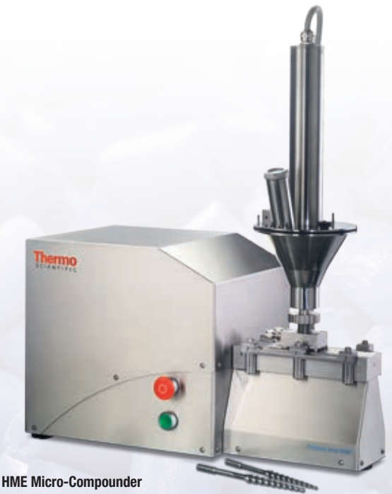
Pharma mini HME Micro-Compounder