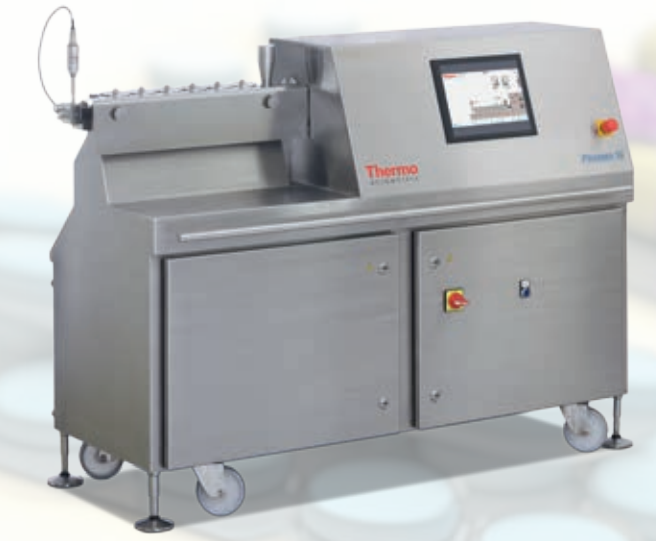
Pharma 16 Twin-Screw Extruder