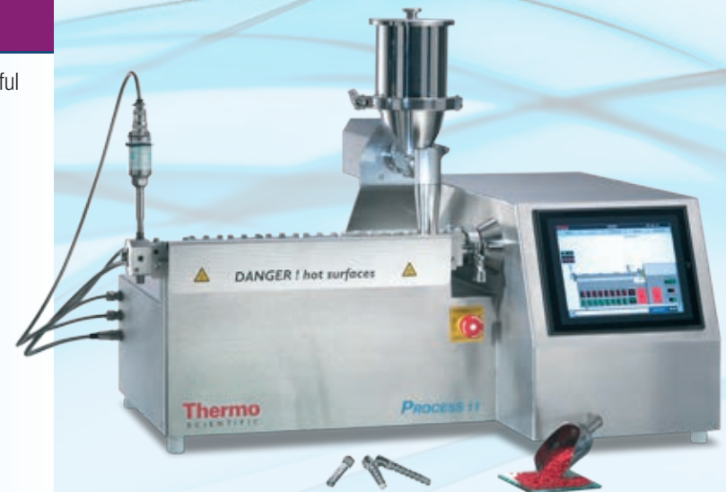
Process 11 Extruder