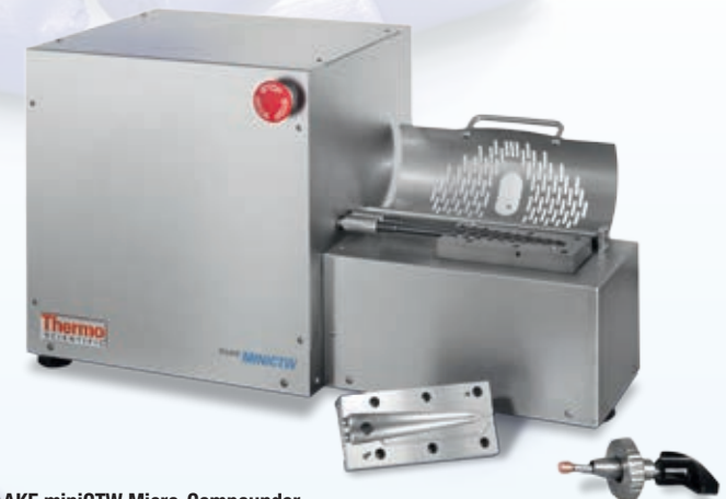
HAAKE miniCTW Micro-Compounder