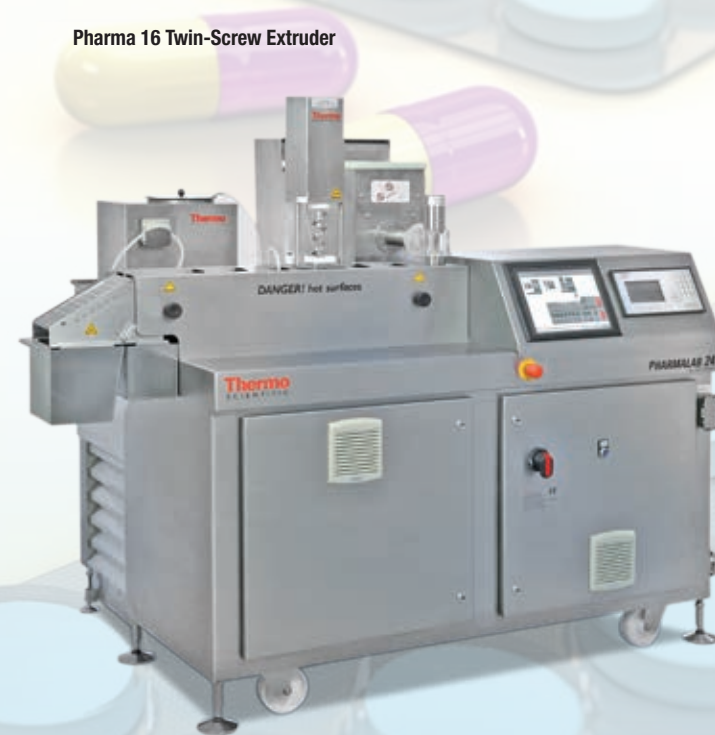
Pharma 24 Twin-Screw Extruder