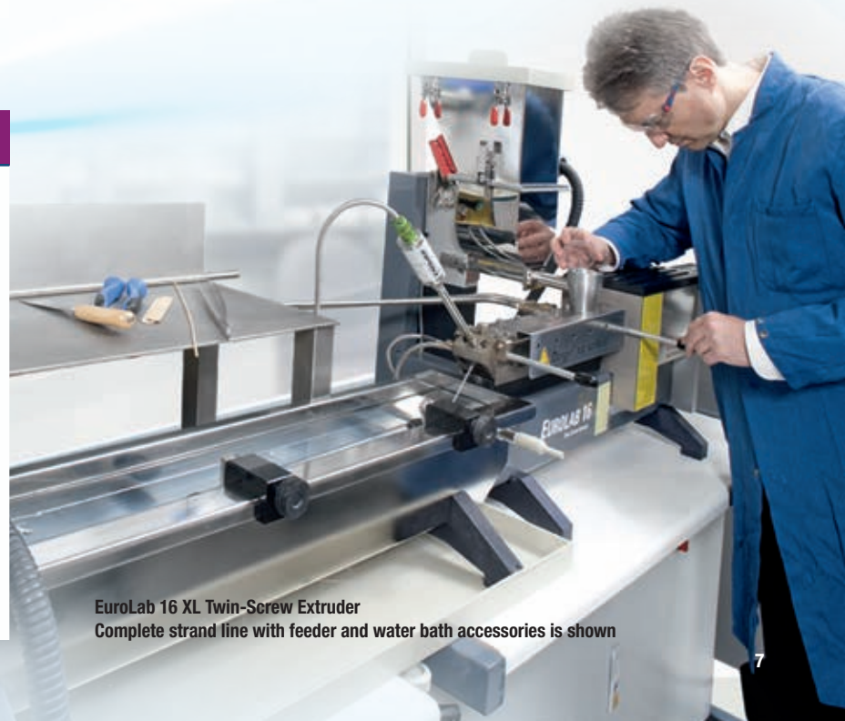
EuroLab 16 XL Twin-Screw Extruder Complete strand line with feeder and water bath accessories is shown