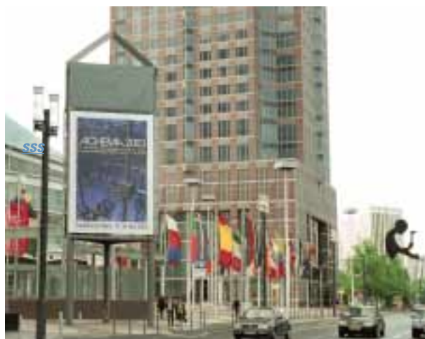
The entrance to ACHEMA