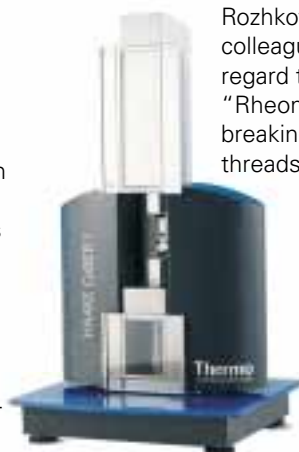
HAAKE CaBER extensional rheometer