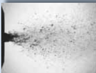
Newtonian substance (1)